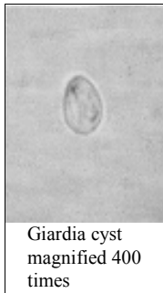
Giardia cyst magnified 400 times