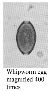
Whipworm egg magnified 400 times