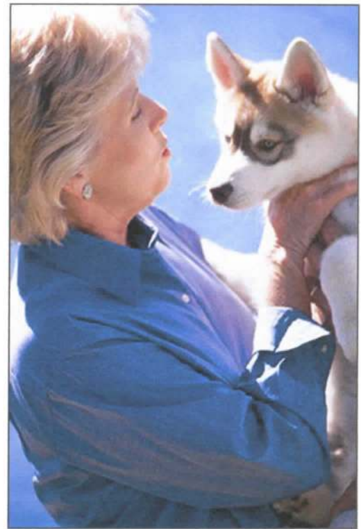
Table or people foods are not usually recommended for pets. Because they are usually very tasty, dogs will often begin to refuse their well-balanced dog food in favor of table food. If you choose to give your puppy table food, be sure that at least ninety percent of its diet is from a quality commercial puppy food. If not, follow a properly formulated recipe that has been developed by a formally trained veterinary nutritionist.

Each of the types of food has advantages and disadvantages. Dry food is definitely the most inexpensive. It can be left in the dog's bowl without spoilage for longer periods of time than canned or moist foods. Semi-moist foods may be acceptable, depending on their quality. The texture may be more appealing to some dogs, and they often have a stronger odor and flavor. However, semi-moist foods are often high in sugar and calories and should be carefully chosen based on their nutritional qualities rather than taste, packaging or consistency. Canned foods are a good choice to feed your dog, but are considerably more expensive than either of the other forms of food. Canned foods contain a high percentage of water, and their texture, odor, and taste are very appealing. However, canned food will dry out or spoil if left out for prolonged periods of time. Canned food is generally more suitable for meal feeding rather than free choice feeding.